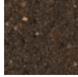
Dark Cork Colourless

High performance in thermal and acoustic insulation. Fire retardant. It is finished with colourless aqueous coating with properties of water repellency, stains and high resistance to UV.