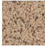
Light Cork Colourless