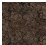
Dark Cork Colourless

High performance in thermal and acoustic insulation. Resistant to abrasion and to impact. Waterproof and fire retardant. Finishing with colourless aqueous coating with properties of water repellency, oil, stains and dirt as well as high resistance to UV and aging.