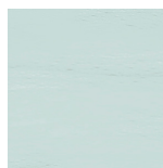
BSHV13 Baby Blue