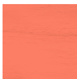
BSHV7 Fond Orange