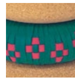
V5 Scared blue Flower pattern