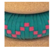
V5 Scared blue Arrow pattern