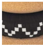
V2 Grumpy black Arrow pattern