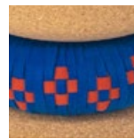
V15 Deep blue Flower pattern