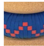
V15 Deep blue Arrow pattern