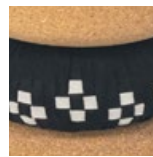
V2 Grumpy black Flower pattern

Felt waste from the Portuguese hatmaking industry, intertwined in a pattern. Textile composition: Merino wool.