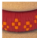
V11 Hot red Flower pattern