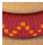
V11 Hot red Arrow pattern